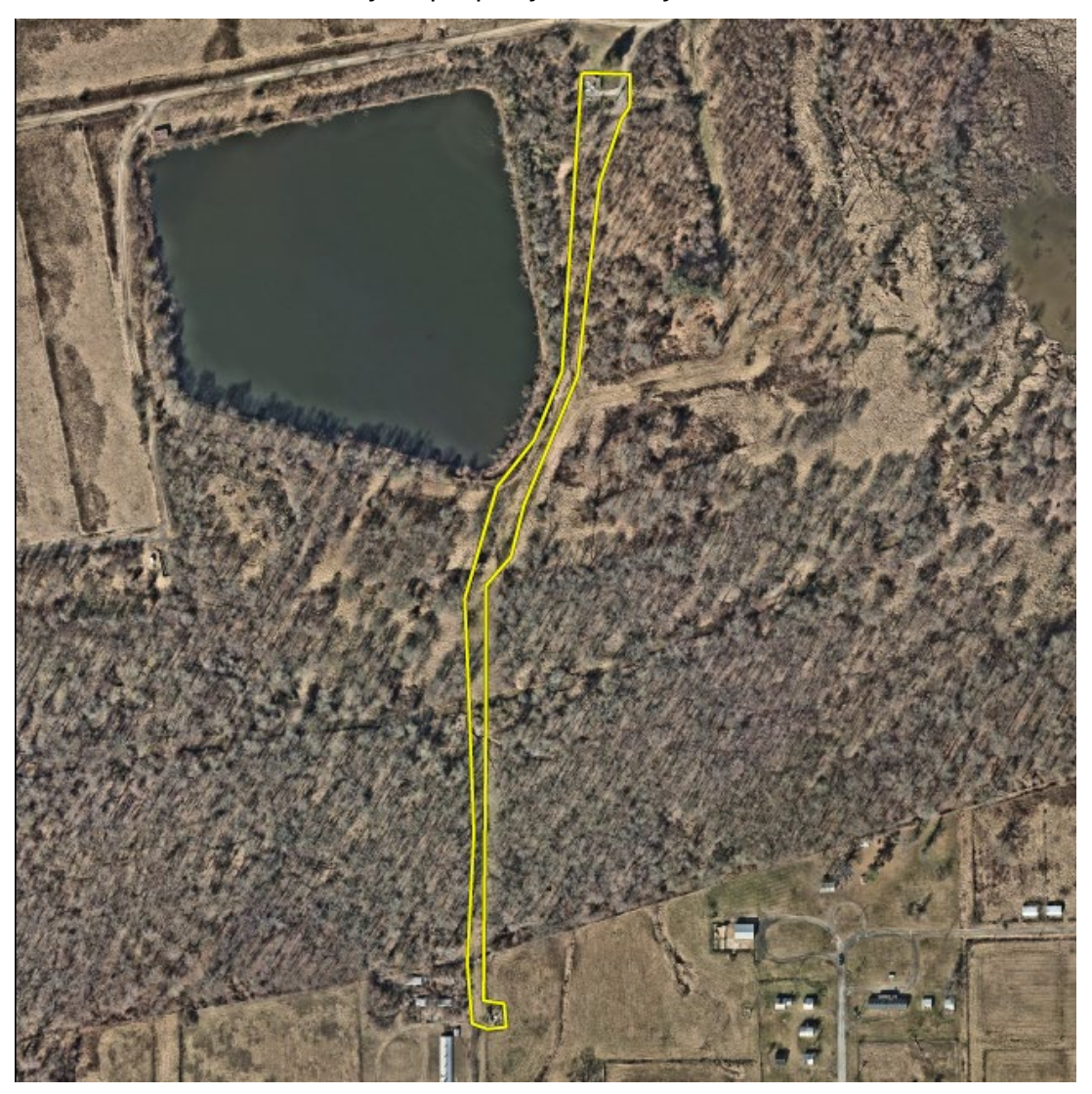
Figure 2.1: Location of proposed activity.