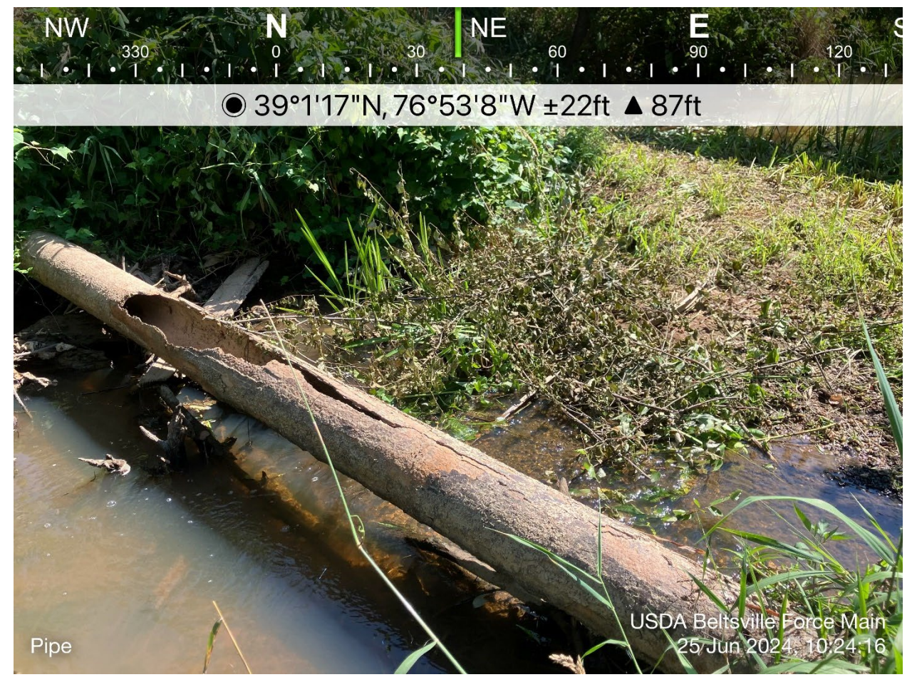
Figure 1.1 Exposed and damaged sewer pipe within stream.